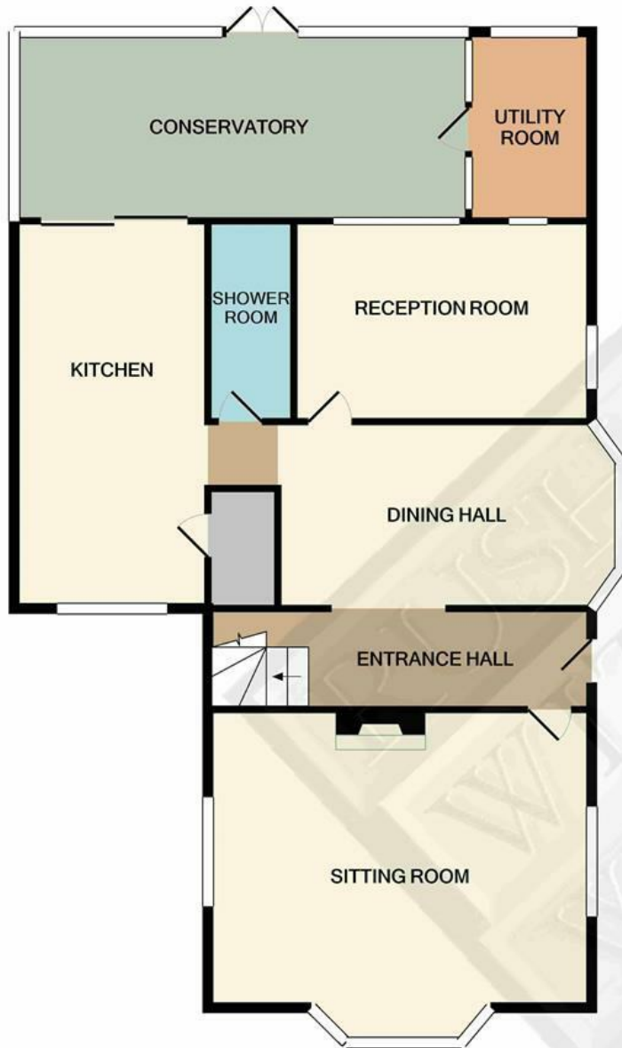
GROUND FLOOR APPROX. FLOOR AREA 1007 SQ.FT. (93.6 SQ.M.)