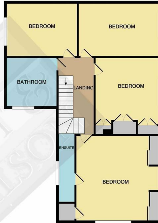
1ST FLOOR APPROX. FLOOR AREA 789 SQ.FT. (73.3 SQ.M.)

TOTAL APPROX. FLOOR AREA 1796 SQ.FT. (166.9 SQ.M.)